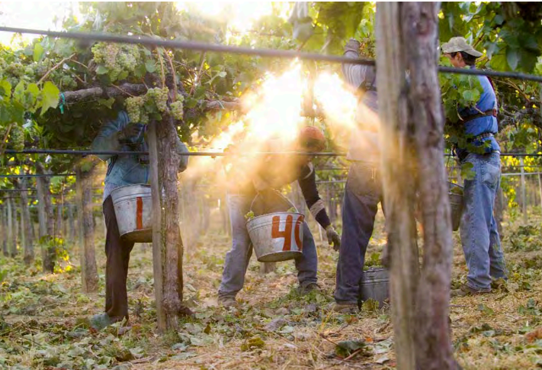
Harvesting Chardonnay at sunrise.