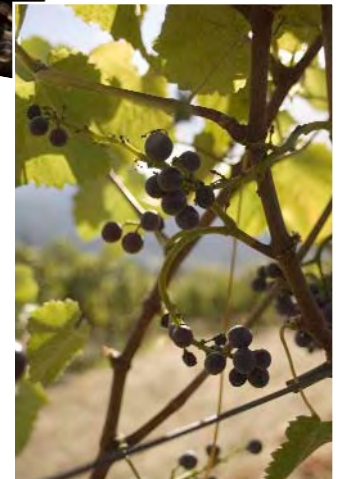
A shattered Pinot Noir cluster in Navarro's Marking Corral vineyard, September 2005. Pinot Noir is particularly vulnerable to shatter and 2005 was an unforgiving vintage. Some of the grapes fall off after bloom which is one of nature's ways of reducing the crop.

The flavors suggest cherry, strawberry and blueberry with hints of spices and bacon that complete the signature of Navarro's Méthode à l'Ancienne's succulent core. Gold Medal winner. Best of Show.