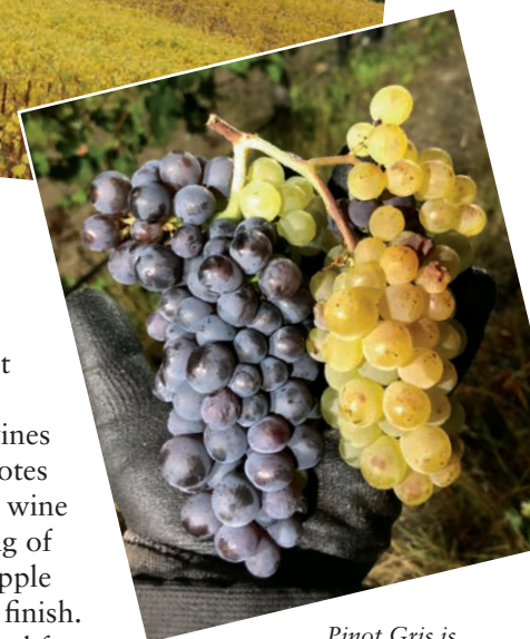
Pinot Gris is a genetic mutation of Pinot Noir and is genetically unstable so we frequently see Blanc and Gris grapes in the same cluster.

The wine produced from VF Ridge is perfumed with classic nut oil flavors; a 30% addition of VF to the Middle Ridge wines added nut oil flavors to the mid-palate. Gold Medal winner. Best of Class.