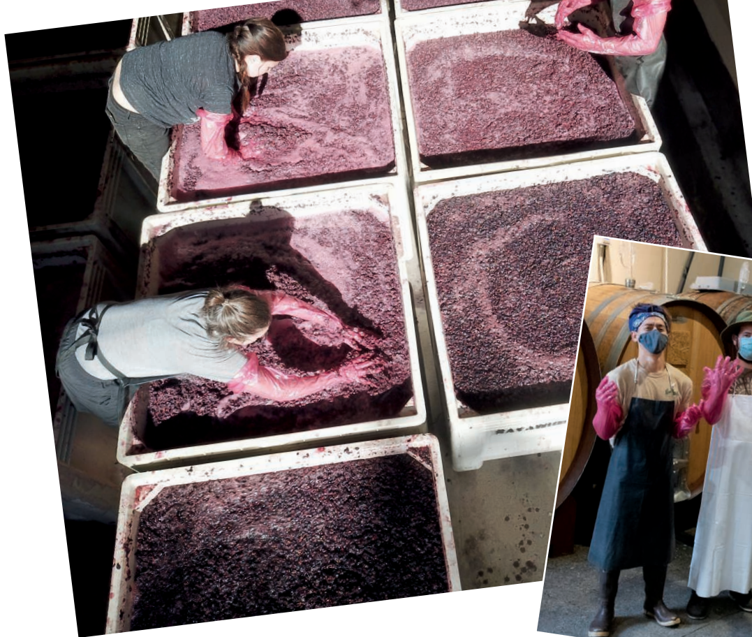
Pigeage à la Navarro

Navarro winery crush interns ready for punchdowns, September 2020. In spite of masks, social distancing, smoke and ash—not to mention the lack of a sit-down hot meal at noon—it was one of the best teams we've seen at Navarro.