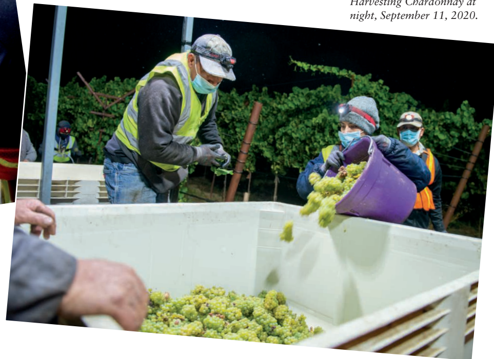
Harvesting Chardonnay at night, September 11, 2020.