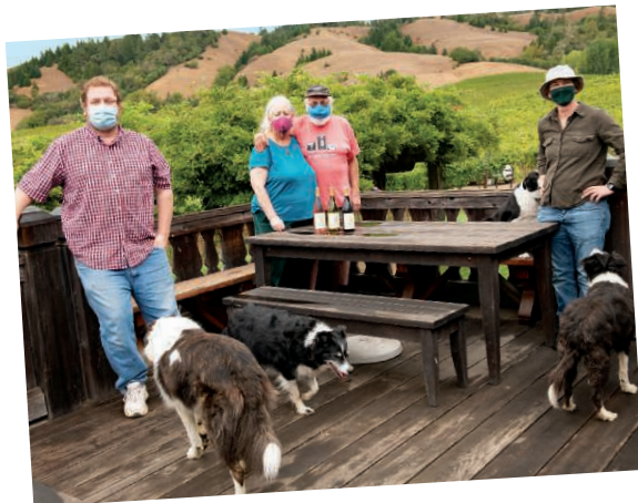
We've missed sharing harvest lunches with our family and crew this year.