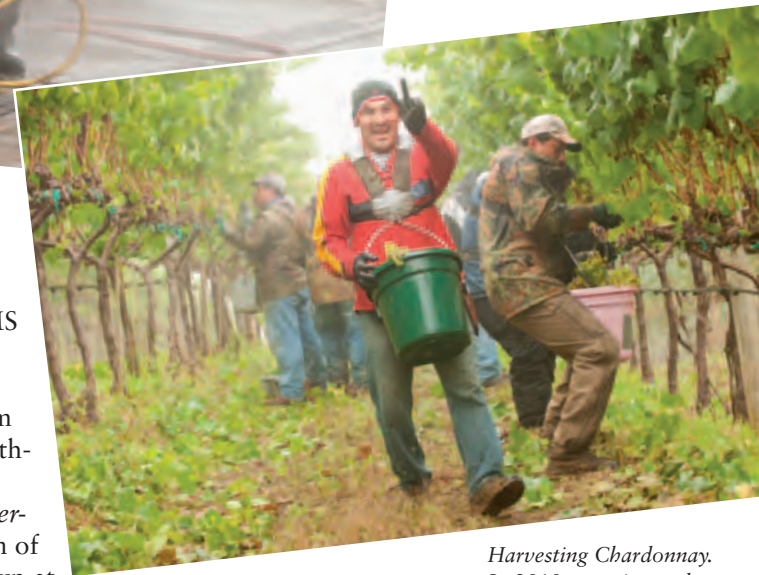
Harvesting Chardonnay. In 2010, our vineyard crew elected to form competitive teams to harvest the grapes rather than being paid individually. One member of the team preceded the pickers, pulling leaves to expose the fruit.

wine is composed of two vineyards' renditions of FPMS 17, one from the Anderson Valley and the other from Potter Valley, north-east of Philo. The crisp, citrusy Anderson Valley portion of the wine was grown at neighboring Valley Foothills Vineyard in the Day Ranch block; it was planted in 2004 and trained to a T-top trellis. Vines at the M&M Ranch in warmer Potter Valley are trained on a closely spaced VSP (vertically shoot positioned) trellis, producing fruit with an apple-melon flavor core. Both parts of the blend were aged eight months in seasoned French oak barrels adding a coconut and butterscotch note. We think you will be flabbergasted that this Chardonnay costs less than eleven bucks a bottle by the case.