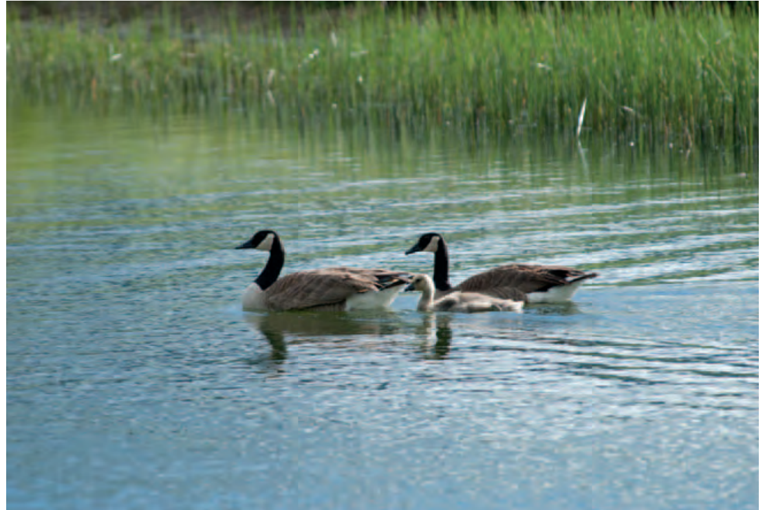
Canadian geese frequently visit Navarro's pond adjacent to our Gewürztraminer fields. We don't use synthetic insecticides or herbicides, so the fields and ponds are safe places to grow a new family.