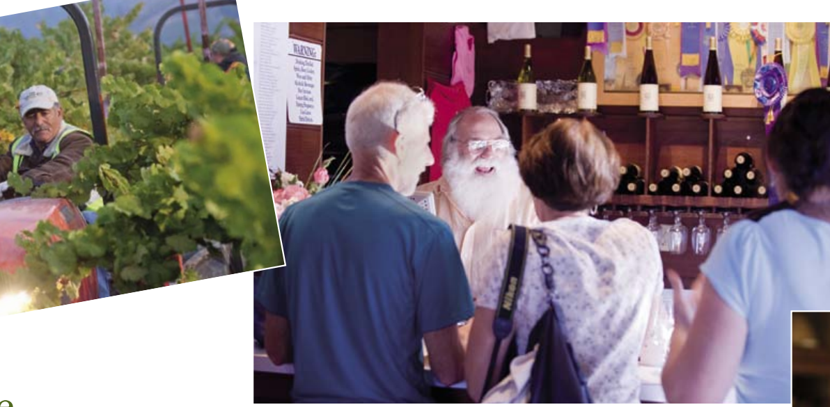
Since Navarro's production and release of sparkling wine is sporadic, it is always snapped up during the holidays, so please don't procrastinate placing your order.