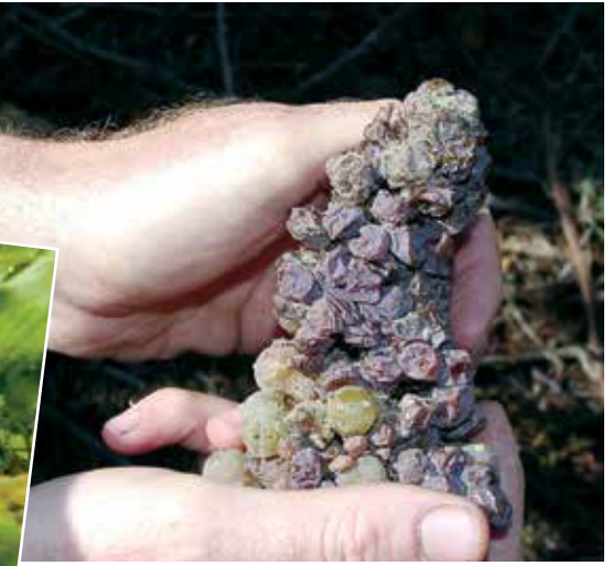
Botrytis affected cluster, sufficiently shriveled to harvest for cluster select wine. For the first few years we threw away rotten grapes because they looked so unappetizing. Then in 1979, a German winemaker friend encouraged us to eat some of the dehydrated berries; they were delicious and so began our fascination with making these stunning wines which are perfectly suited for long term aging. Have an important date in 2012 or 2013 to celebrate several years or decades from now? Botrytis-affected wines have the longest-term aging potential of any class of wine. We've had the pleasure of tasting a bottle of Tokaji from 1845 that Grandpa had squirreled away. It was still delicious and opening a wine laid down by a parent or grandparent makes for a joyful and thankful celebration.