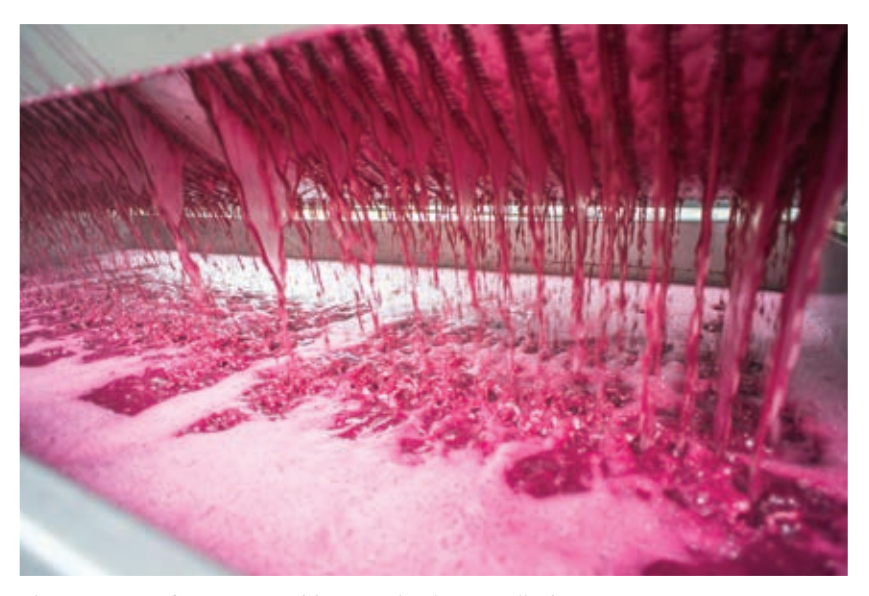
The wine press' first squeeze of fermented red must. All of Navarro's wines are produced entirely from free-run juice and the first pressing; the later pressings are more astringent and are always sold off as bulk wine.