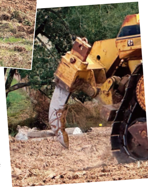
These are the three-foot shanks that the Cat is using to rip through the soil.

cool-climate varieties allowing for controlled stress which helps preserve acidity and aromatics. 60% of the wine was cool-fermented in stainless steel to retain the grape flavors, then aged