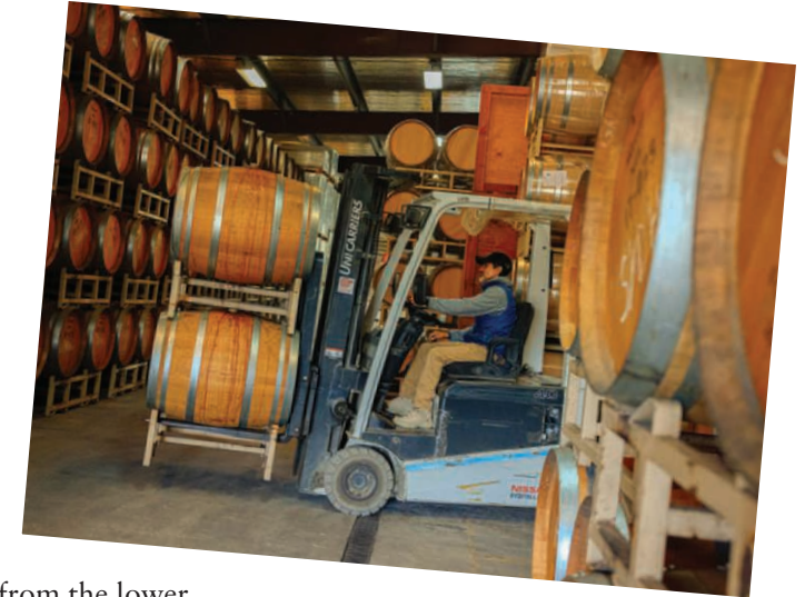
Ulises stacking barrels in the main barrel cellar. The Navarrouge was aged for 10 months in seasoned French oak barrels.